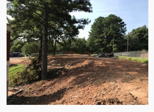
Cleared trailer area